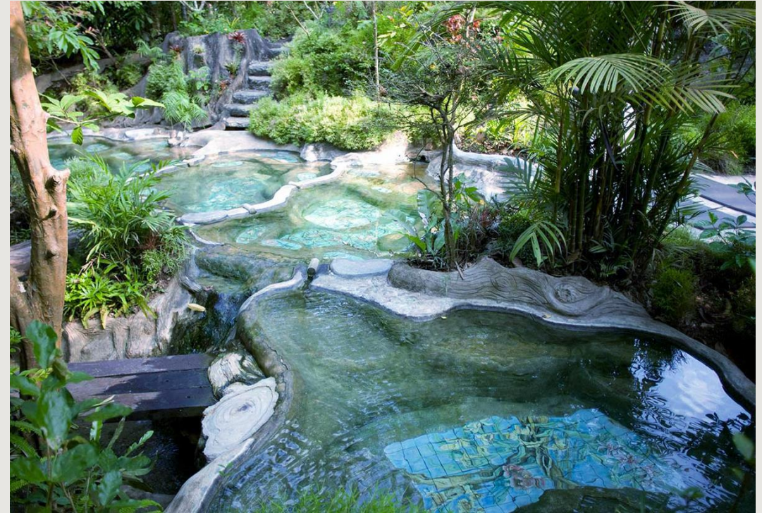
JUNGLE HOT SPRINGS