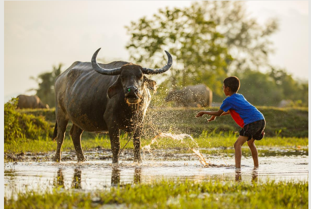
KOH KLANG LOCAL LIFE