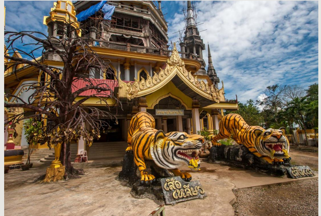
WAT THAM SUEA (TIGER CAVE TEMPLE)