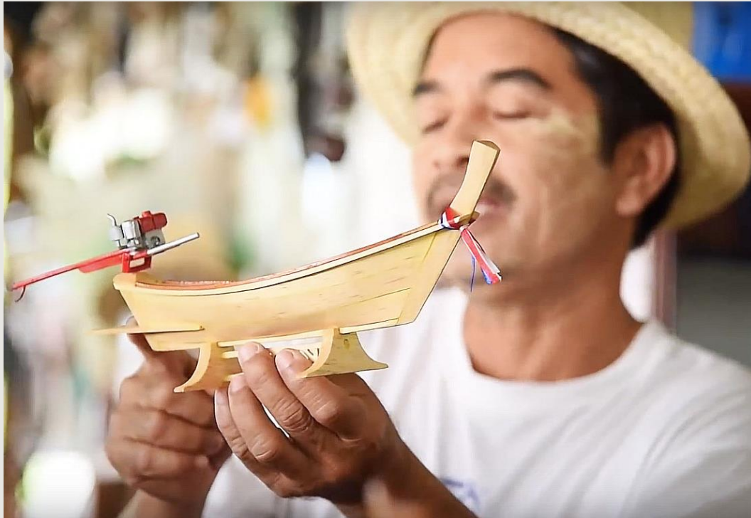
KOH KLANG HANDICRAFTS