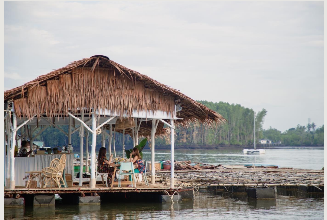
LUNCH ON A FLOATING RESTAURANT