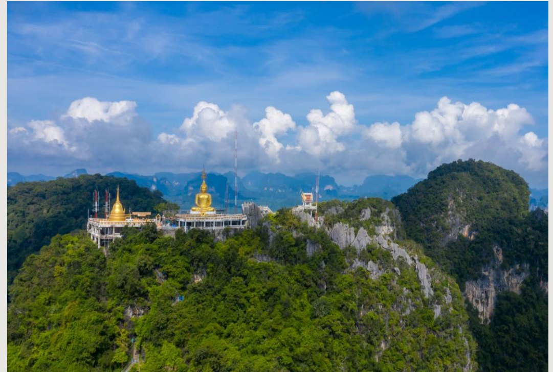
WAT THAM SUEA (TIGER CAVE TEMPLE)