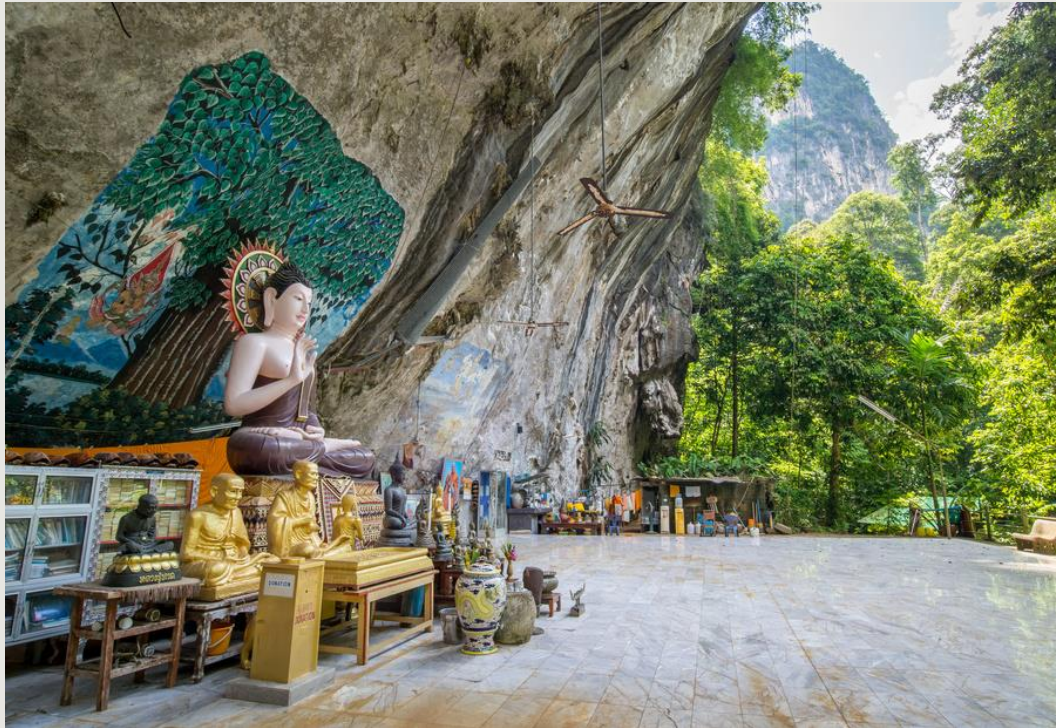
WAT THAM SUEA (TIGER CAVE TEMPLE)