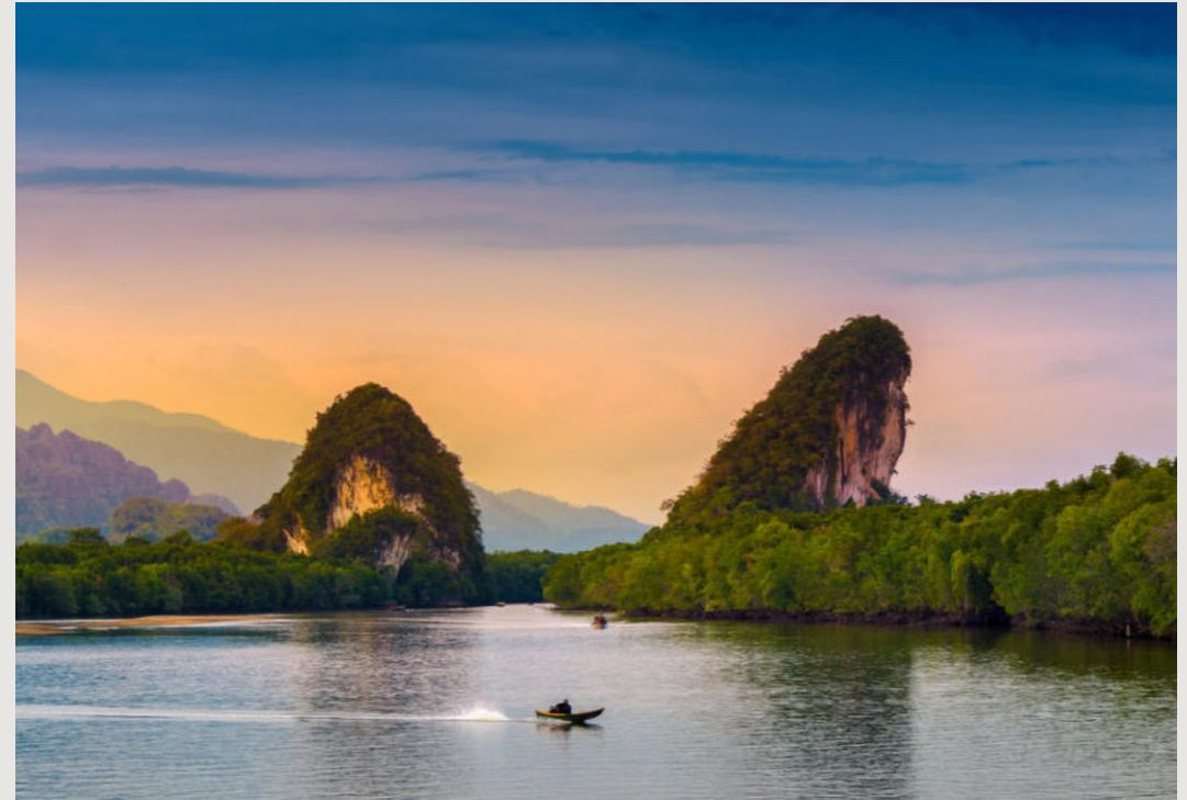
KHAO KHANAB NAM