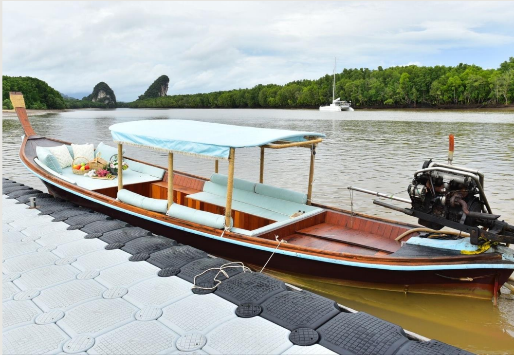
LONGTAIL BOAT TRIP