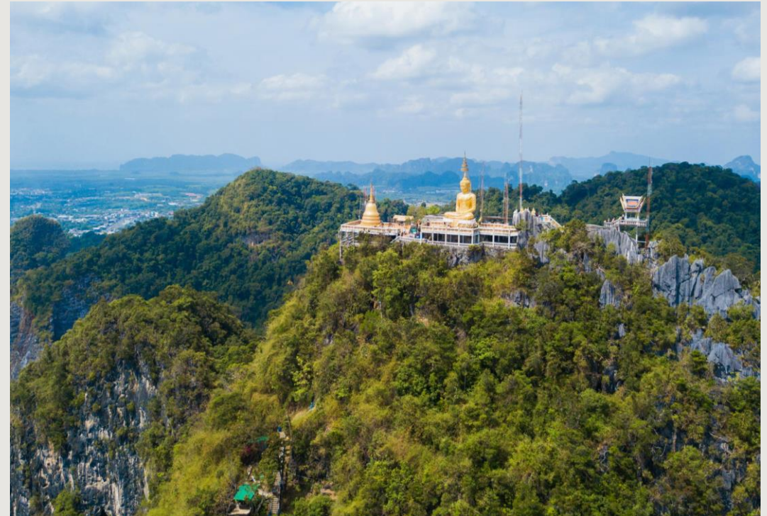
WAT THAM SUEA (TIGER CAVE TEMPLE)