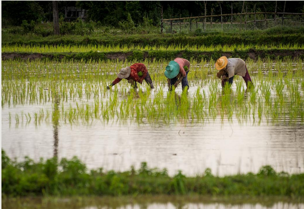
KOH KLANG RICE FIELDS